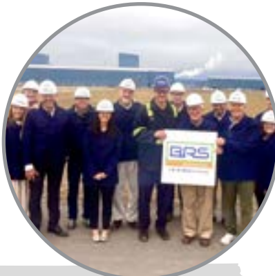
FAYETTEVILLE, March 2024

In 2024, the AEDC Council quarterly meetings were held in Fayetteville, Hot Springs, Jefferson County, and Mississippi County. These meetings afforded opportunity for the full Council to meet with local business and community leaders at each of these locations.