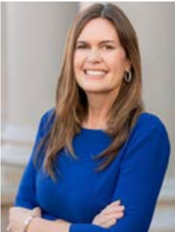
Sarah Huckabee Sanders Governor of Arkansas