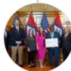
Sanders, AEDC Announce 17 Community Grants Totaling Nearly $8.5M