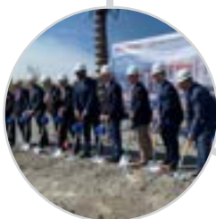
Elopak Breaks Ground on State-of-the-Art Facility in Little Rock