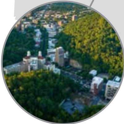
JEFFERSON COUNTY, September 2024