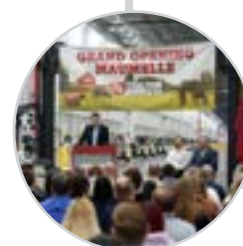
Tractor Supply Co. Celebrates Grand Opening of Distribution Center in Maumelle