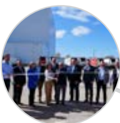
Americold Holds Ribbon Cutting for Facility Expansion in Russellville