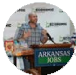
Hope Baking Company Expands in Arkansas, Creating 266 New Jobs